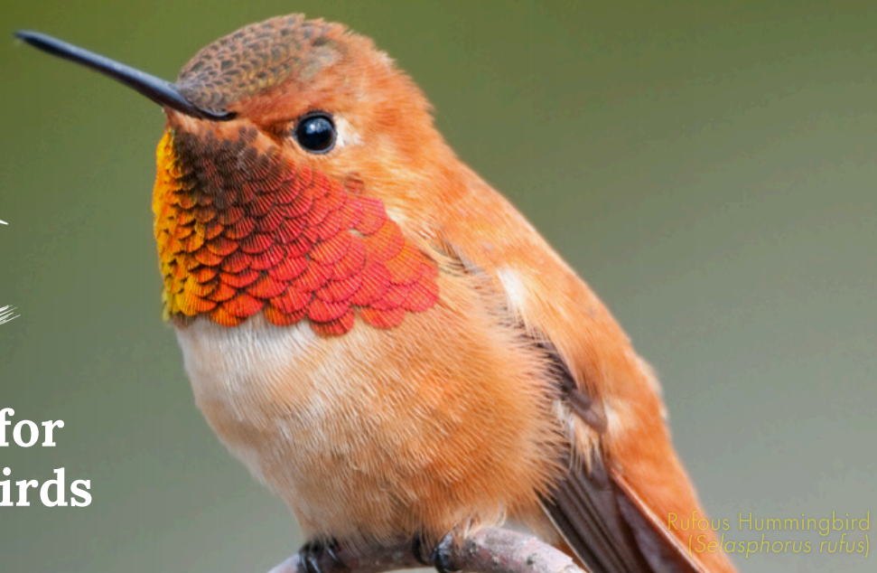
Rufous Hummingbird ( Selasphorus rufus )